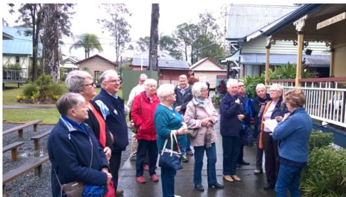
"Rugged up and being briefed on our Tour"

Wednesday June 26 th marks the day when seventeen intrepid members of our Society braved the savage elements, well maybe that's a bit much, and visited the Beenleigh Historical Village and Museum.