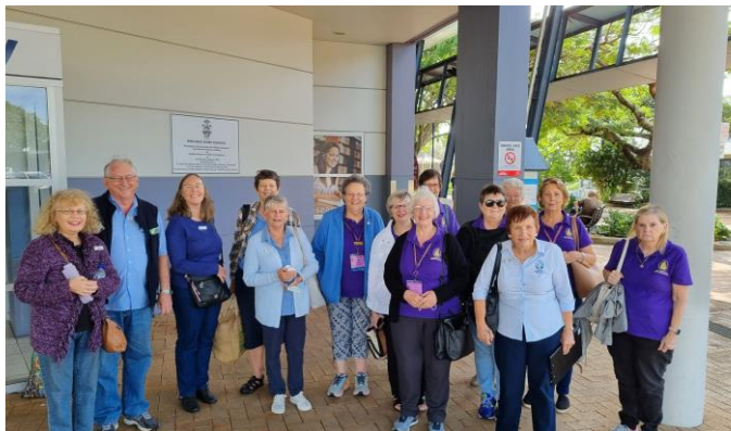
Arriving at the Cleveland Library

On 23 May we hosted 10 members of the Caloundra Family History Research group. A wonderful day of sharing, talking, and exploring ensued.