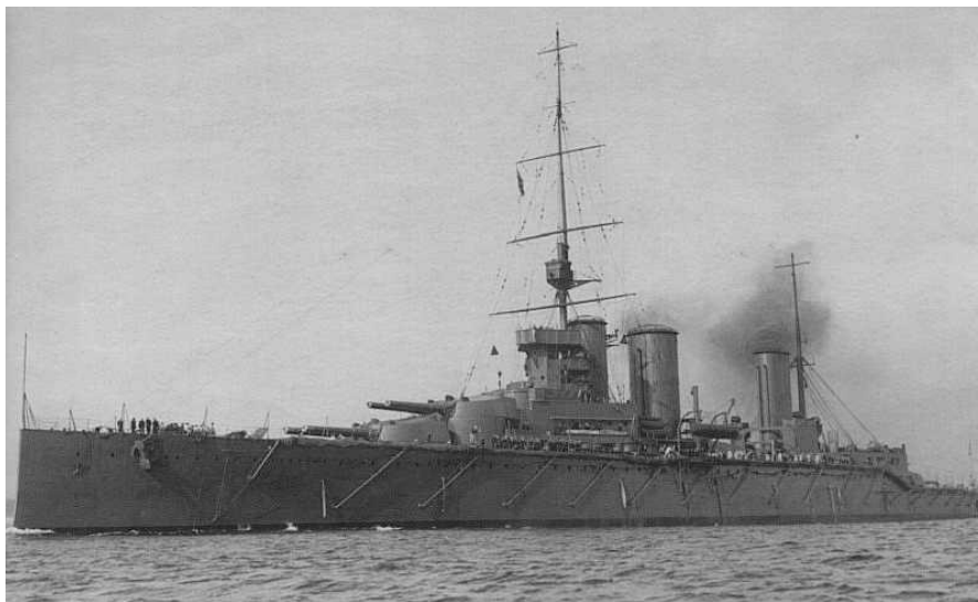
H.M.S. Queen Mary in February 1916

H.M.S. Ocean was a battleship displacing 12,950 tons and armed with four 12-inch and twelve six-inch guns. She was launched in 1898. In early February 1915 she aided the defence of the Suez Canal against the Turks and then sailed to take part in naval operations in the Dardanelles Campaign. She became part of a squadron comprising HM Ships Albion , Irresistible , Majestic , Triumph , and Vengeance , which from March 1, 1915, bombarded various forts and strait defences. On March 18, after standing by the disabled Irresistible , Ocean herself struck a mine and was almost simultaneously crippled by shelling. She sank later that night.